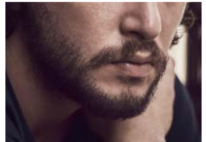
6. Kit Harington