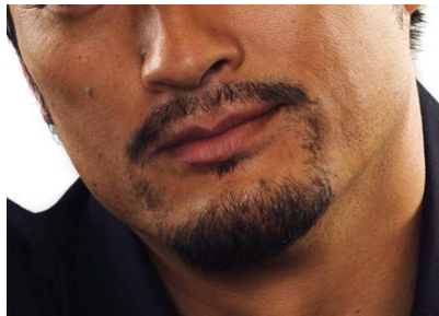
5. Ken Watanabe