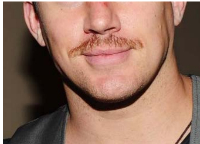
2. Channing Tatum