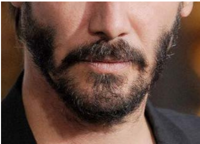
1. Keanu Reeves